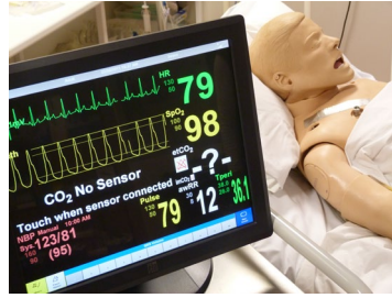
ALS Manikin and Monitor