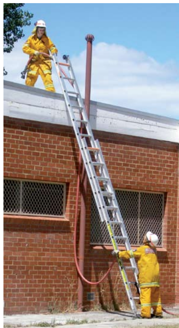
Fire drill by the New Norfolk Volunteer Bush Fire Brigade