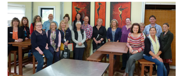
Photo: Information Session and Workshop participants

Attendees identified opportunities, gaps and challenges related to student placements and supervisor support. The attendees valued the opportunity to network, share ideas and contribute towards the Rural Multidisciplinary Training Program student expansion project.