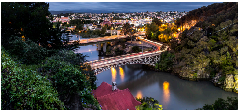
King's Bridge Launceston

We look forward to seeing everyone at next year's symposium.