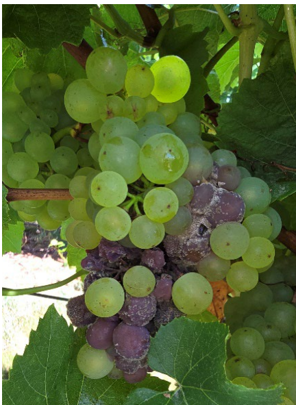
Botrytis bunch rot developed at 7 of 11 trial sites in 2023/24 even though the weather was less favourable for botrytis than in other years.

Qualitative research is thus vital to inform how OFE methodology can be improved, extended and sustained for other production issues in winegrapes and for other crops.